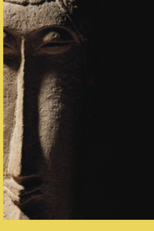
TABLE OF REMEMBRANCE IN DECEMBER